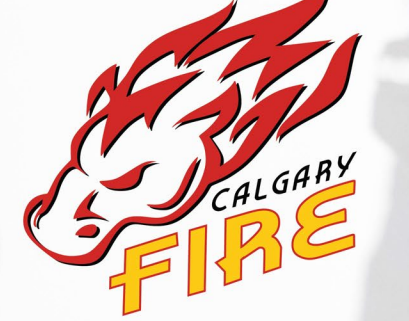
CALGARY FIRE RED U15 FEMALE AA